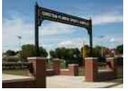
The Christian Plumeri Sports Complex is located approximately 10 minutes from the Saint Rose campus. Take I-787 South until it ends at light. Take right onto Southern Boulevard. At light turn left onto McCarty Avenue, then left onto Frisbie Avenue. Complex will be on your left.