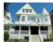
Undergraduate Admissions 1001 Madison Ave.