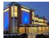
Massry Center for the Arts 1002 Madison Ave.