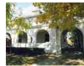
Graduate Admissions 919 Madison Ave.