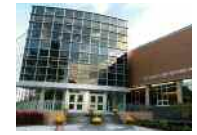
Events and Athletics Center, 420 Western Ave.