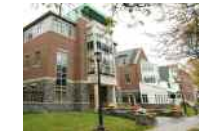
Thelma P. Lally School of Education, 1009 Madison Ave.