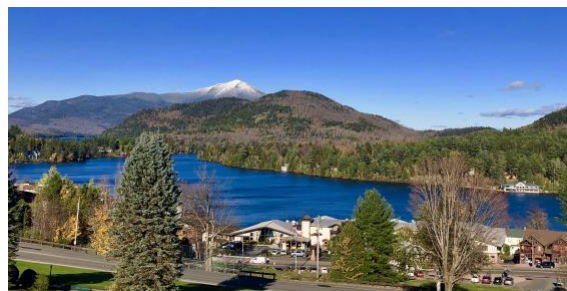
NYASP 2018 Conference: Lake Placid, NY