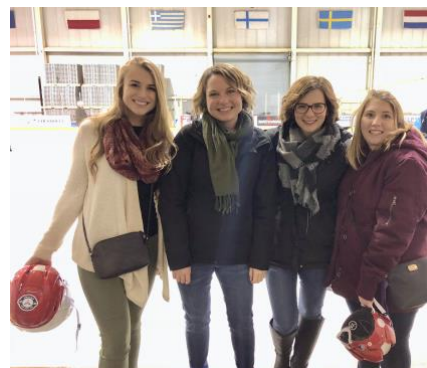
Students and faculty at the Slapshot Charity event (Herb Brooks 1980 Ice Arena)