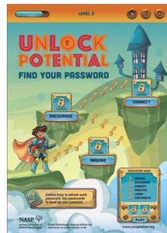
SPAW 2018: Nov 12-16